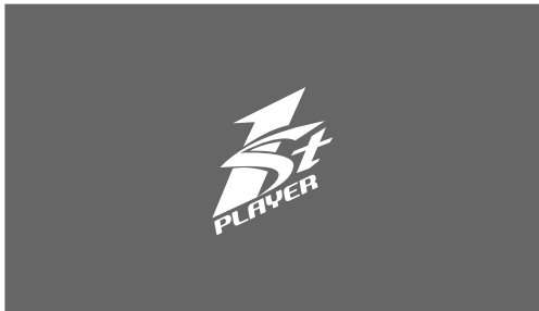
PC GAMING CASE H6